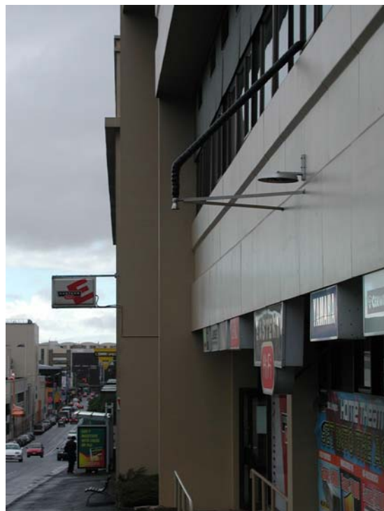
View east along Khyber Pass Rd towards Newmarket - gas inlet attached to side of building.

Buildings on the southern side of Khyber Pass will shield the intakes from southern flow. The buildings on the southern side and the valley nature of the road may result in some canyon effect.