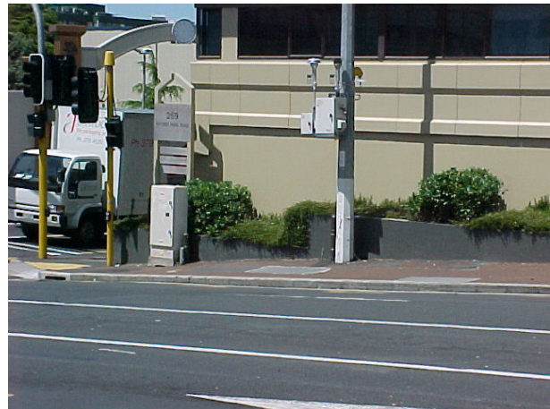
View from west side of Mountain Road. Partisol inlet attached to power pole.