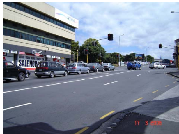
Site looking up Khyber Pass Rd (inlet out of office window above Eastern HiFi Sign).